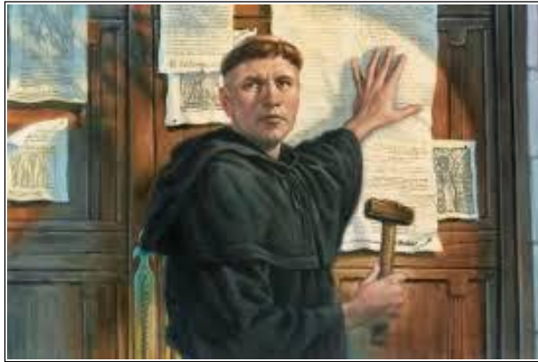
Martin Luther nailing his 95 Theses on the door of the All Saints Church, Wittenberg, Germany, 31 October 1517

In the forthcoming pages, let's look at these 5 slogans of Protestant Reformation in the Biblical light and study their practical implications and relevance in the lives of Christians and the Churches.