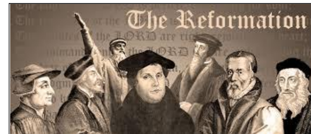
The Protestant Reformers

Dear Reader, may be you can stand up where you are for a minute of silence to thank God for these and many such Reformers who refused to relent saying, “Here I stand!”